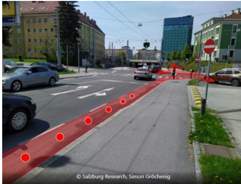
Figure 8:4 VRU paths at an urban intersection