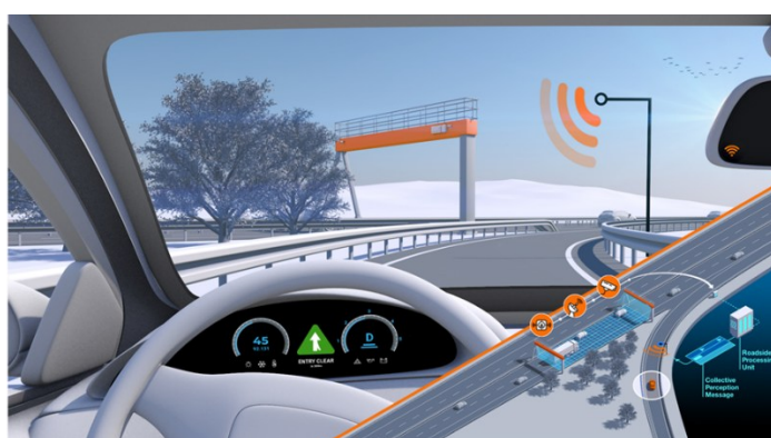
Figure 8:2 Motorway merge situation

Triggering conditions: The CP service is continuously monitoring the environment and generating continuously perception data.