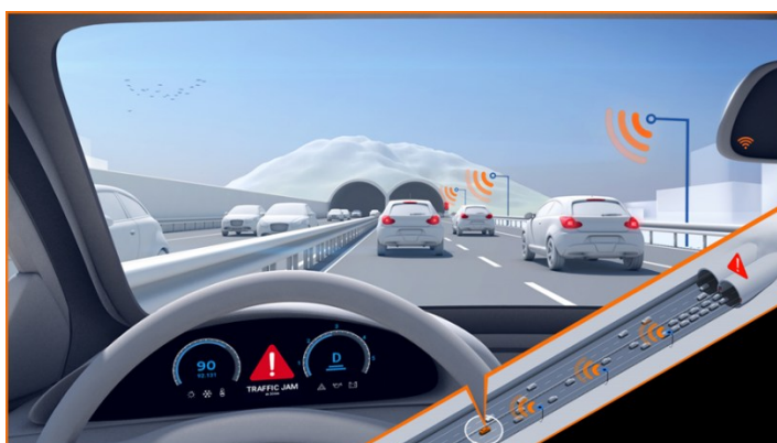
Figure 8:1 Motorway tunnel entry situation